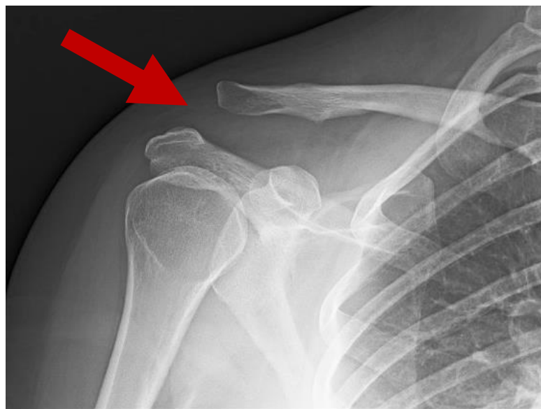
X-Ray of AC joint separation (Grade III)

Acromioclavicular (AC) joint sprains are injuries to the ligaments at the joint where the clavicle (collarbone) attaches to the acromion (roof of the shoulder) of the scapula (shoulder blade). These injuries are commonly referred to as “shoulder separations.” The ligaments that run from the clavicle to the acromioclavicular ligaments or to the corococlavicular ligaments of the scapula help to anchor the collarbone to the scapula (shoulder blade). A sprain indicates that the ligament between the bones is either stretched or torn, thus disrupting the stability of the clavicle. AC joint sprains are graded I through VI, from least to most severe.